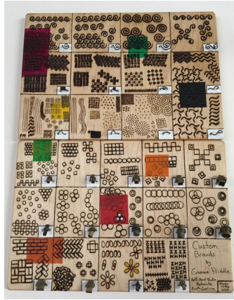
Woodburning Texture Inspirations Graeme Priddle/Melissa Engler