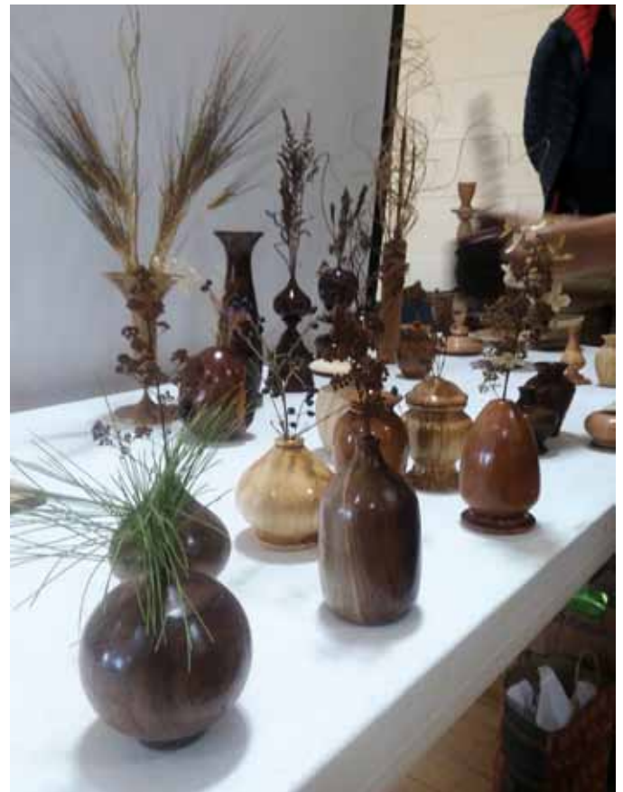
Weed pot challenge: The results of the SIG's weed pot challenge for February

Members were invited to apply each chemical extractive to a cross sample of various wood species, resulting in a variety of opinions about which treatment they preferred.