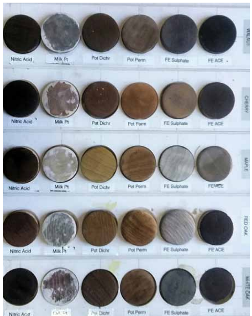
Matrix of Extractives: The finished experiment with all the medallions treated