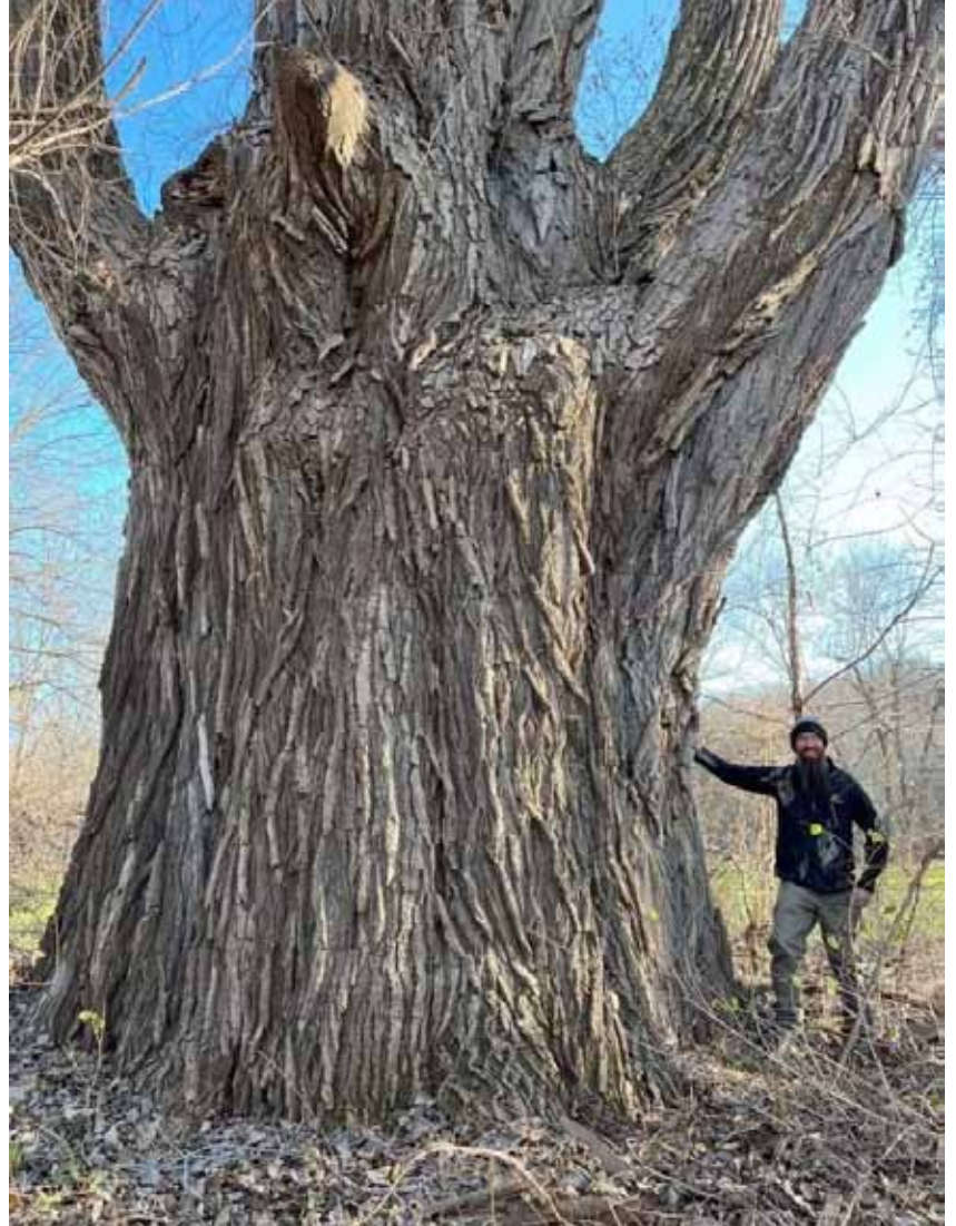
Photo of the Schaghticoke eastern cottonwood.

The list of New York State Big Tree Champions is available in scientific name (PDF) and common name (PDF) . American Forests, which runs the National Champion Trees Program, is the authority for determining which tree species are eligible for champion status. You can view their list of eligible native and naturalized tree species to see if your tree qualifies.