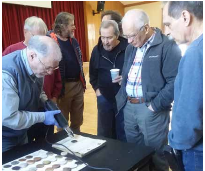
Applying Heat: A heat gun is used to bring out red highlights with Aqua Fortis

The treatments that work well with cherry wood include Potassium