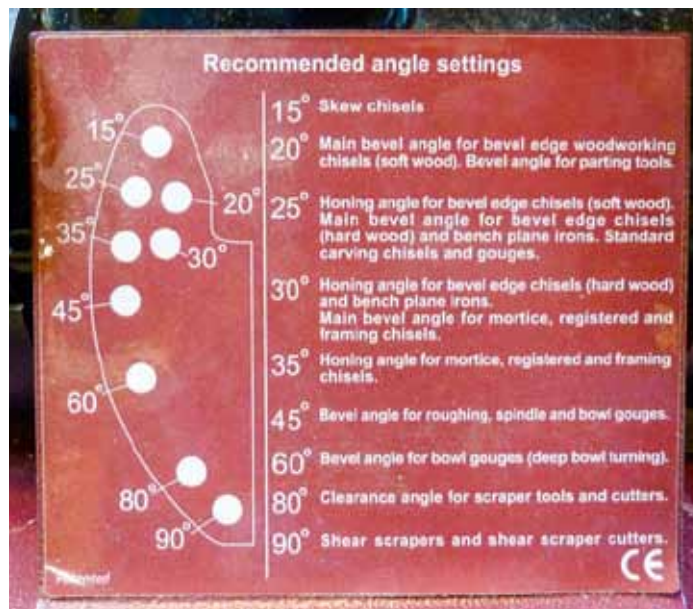
An angle guide on the front of the station lists the built-in settings.

and 90 degrees which adjust the attitude of the grinding platform.