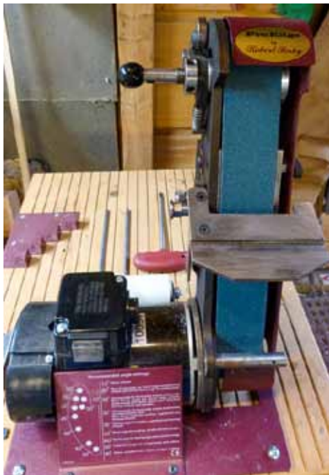
Sorby Pro Edge Sharpening Station is compact and features a groove in the platform to hold various jigs.

The pre-set angles are easy to lock in, thanks to the integrated angle template with position holes that accept a threaded bolt. The pre-sets include the following grinding angles: 15, 20, 25, 30, 35, 45, 60, 80