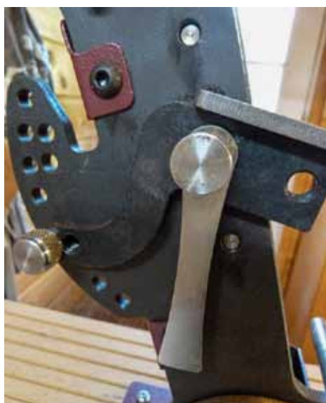
It's easy to set angles, using the selector on the side of the machine.