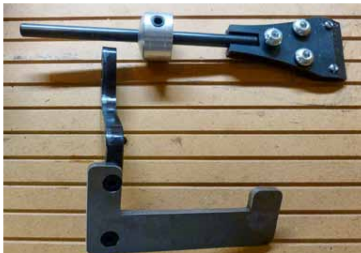
Other optional accessories include a jig for sharpening knives and a narrow platform for sharpening smaller tools.