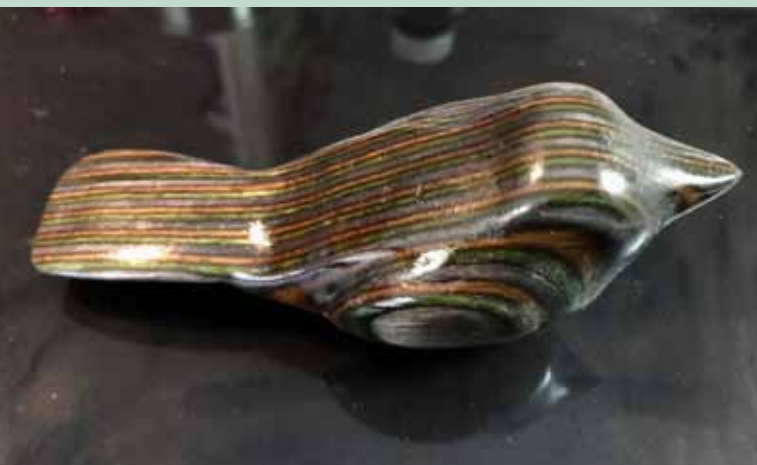
Diane Balch carves in COVID shutdown. The bird is made from dyed plywood. The finish is a coat of "True Oil" used for gun stocks.