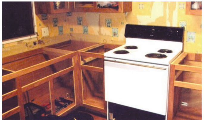
Cabinet carcasses installed in Bob Doran's vacation house.