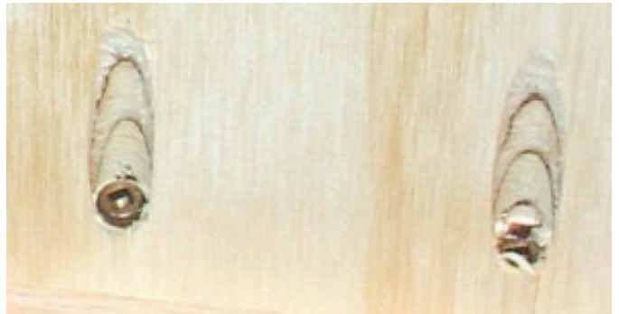
Kreg joinery requires a flush fit.