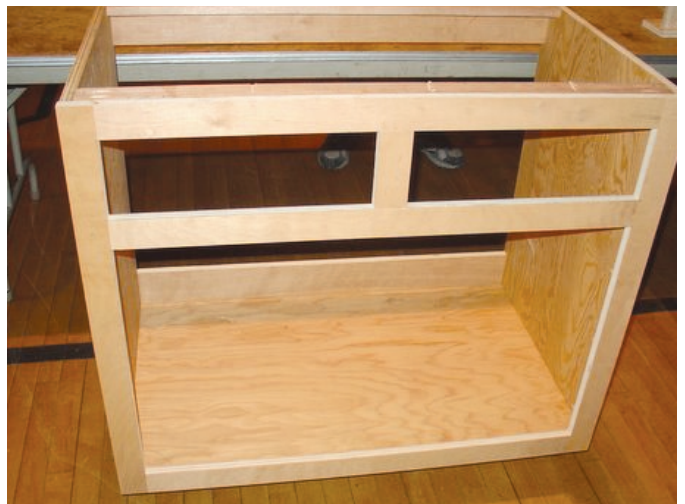
Cabinet completed during demo using Kreg system.