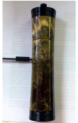
The beautiful grain in this buckeye burl peppermill is showcased by a simple shape

Execution is the culmination of all your abilities to turn, sand and finish a piece. Sandpaper is simply another tool for preparing bare wood or prepping finishes between coats. Sanding techniques are important to master. Sanding scratches on bare wood can add a great deal of additional time and effort to your work. In addition, the heat build-up will have