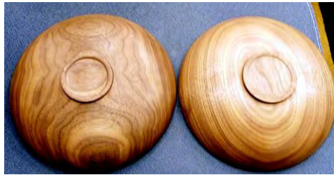
Grain presents quite differently by simply flipping the orientation of the wood -- bowls by Celia