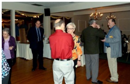
Members mingle during festivities at Twin Lakes

Upcoming: The June 18 meeting will feature representatives from Worth Industries to describe their hardware and finishes.