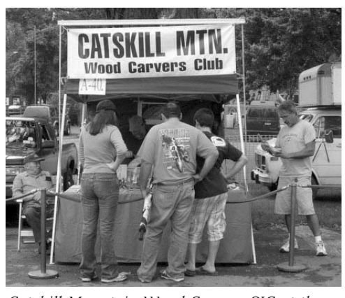
Catskill Mountain Wood Carvers SIG at the Garlic Fest

rail trail. The converted rail bed is now a biking and pedestrian thoroughfare stretching from Kingston to Ellenville in New York State. Historically, this route brought coal from Carbondale, PA to the Hudson River