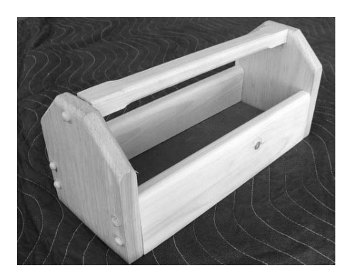
Tool Tote will be featured in Toy Factory

All parts are sanded with 80 grit paper.