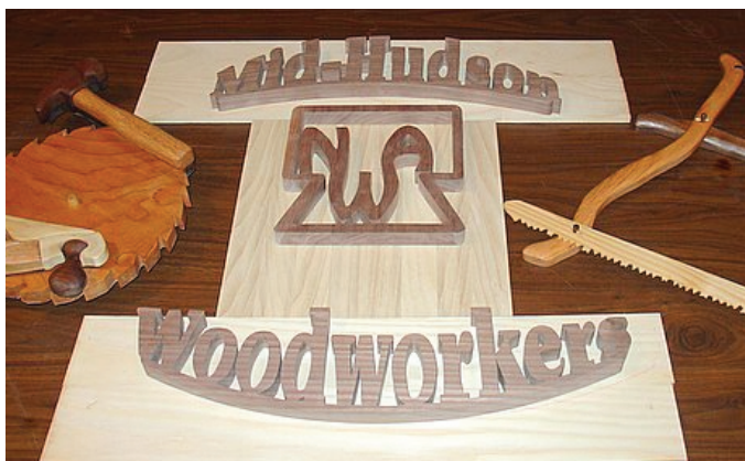
New chapter sign

New Sign: Thanks to Bob Boisvert and the scrollers for producing a new chapter sign for Showcase... their work in progress is pictured below.