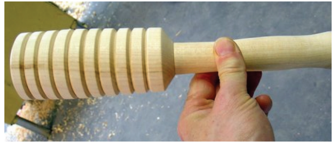
The finished mallet

basic shape. Peeling was done in sections using a flat sided skew (oval skew shoulders not recommended) with a rounded blade. The rounded blade takes the long and short points out of contact with the wood. In this operation, the skew handle starts low and is raised until the bevel engages the blank in a peeling motion. The cutting edge is presented above the midpoint on the blank. The tool rest should be approximately one half inch from the stock and lathe speed does not need to be above 1000 rpm.