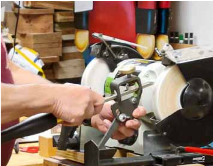
Ray sharpening a gouge using a Wolverine sharpening jig. Hold the tool and jig as shown for better control, not by the end of the handle.

and harder stones for softer steels). When the stones get cupped from use, they must be dressed to restore roundness. Use a diamond point dresser ($12 on Amazon). CBN wheels do not need dressing and will last a lifetime.