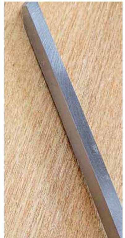
Smooth off the edges of the shaft for smoother movement along the lathe's tool rest.