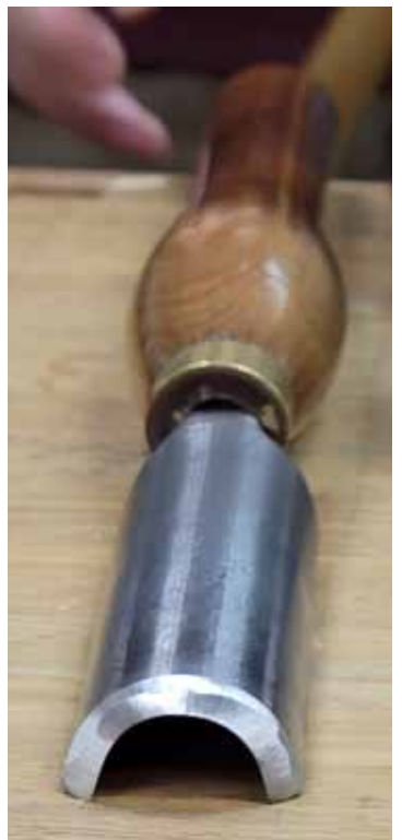
Spindle roughing gouge.