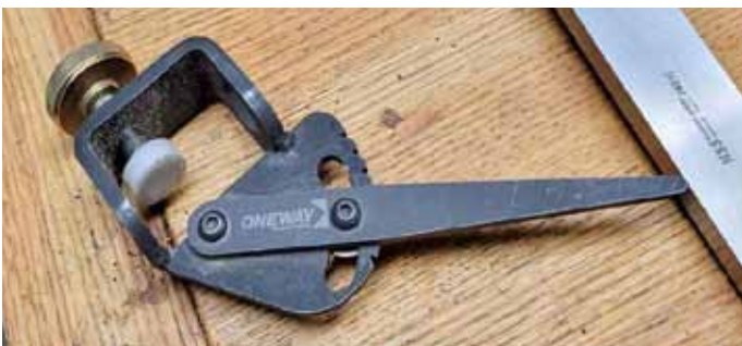
Close up of Wolverine jig.

Skews are sharp but not durable. A coarser wheel puts a serrated edge on the tool (80grit) for durability. A finer wheel (120 grit) makes the tool sharper. The scraper (see photo) has a bevel slightly less than 90 degrees for face plate and spindle turning. The box scraper is held handle up, blade down at a negative angle to the wood. When sharpening, keep the tool flat on the rest. Ray will touch up tools with a diamond hone.