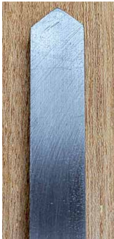
Don's parting tool.

CBN cards are credit card shaped hones to touch up (180 grit on one side, 220 on the other). They can be purchased for $20 from woodturnerswonders.com