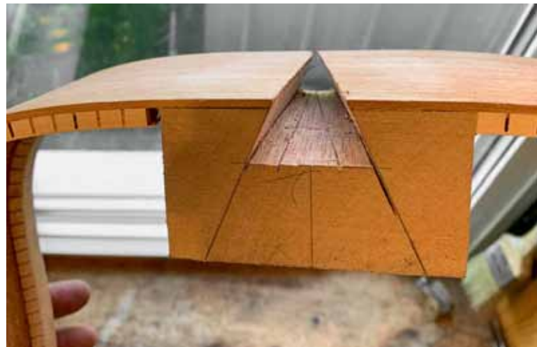
Hand-cut compound dovetail where the neck will attach.

- Bending fret wire into a curve to match the fingerboard, not as most builders do it with the $175 bender from StewMac, but by pulling it at an angle through a hole in a piece of scrap board. Many steps were done without the usual expensive luthier's tools, but in simpler ways with skill and patience.