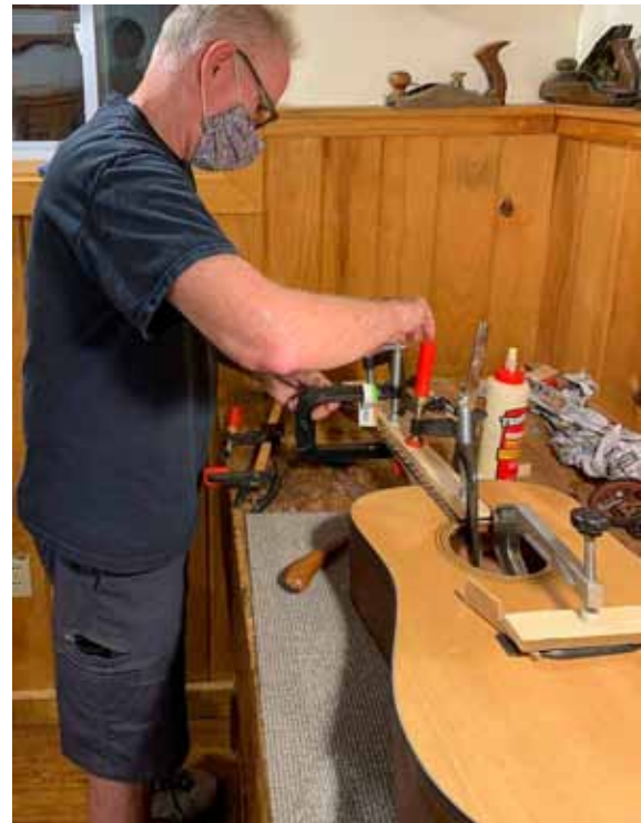
Gluing on the fingerboard and bridge.