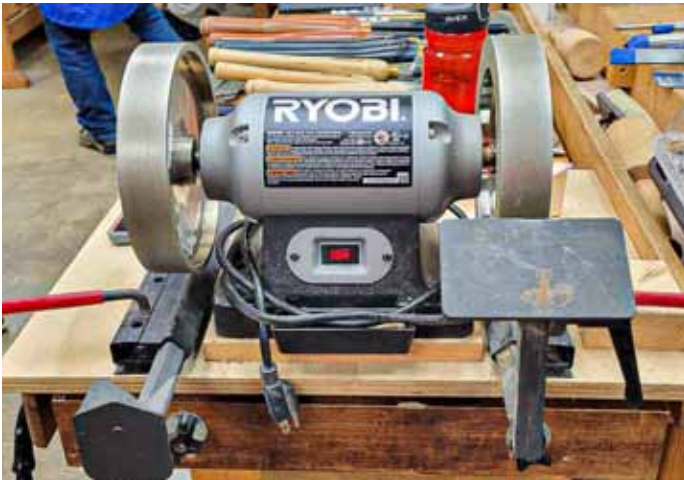
Low speed grinder with CBN wheels.

wheel at 1725 rpms, slow for carbon steel. Use aluminum oxide or silicon carbide (80 and 120 grit wheels (softer stones for harder steels