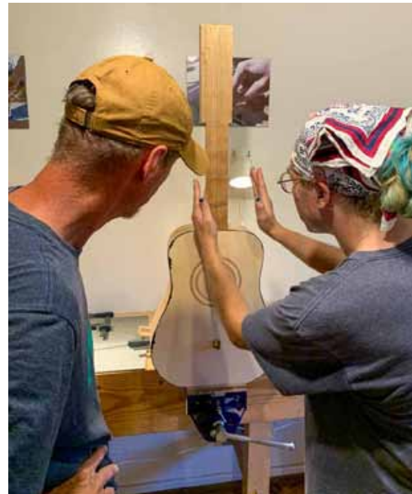
Using a plumb bob to true the neck to the body.