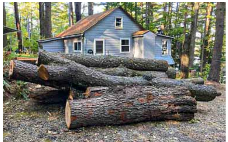
A Mountain of Cherry logs waiting to be cut.