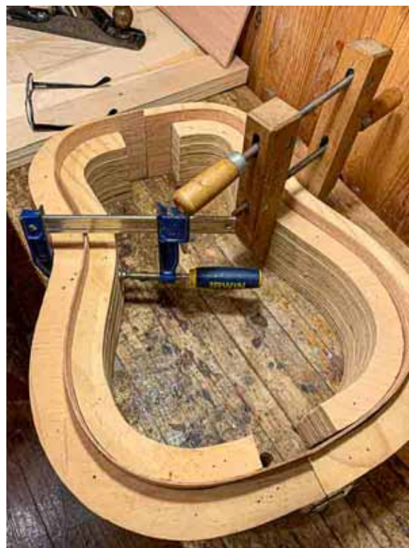
Mahogany sides steam-bent into the form.

Given a few cosmetic booboo's, I did come out with a great sounding instrument - quite amazingly so. I've continued building after that first experience, with materials and help from Bill. I've moved into doing more of the building operations at my home shop, but still depend on Bill for a number of things - cutting the rosette