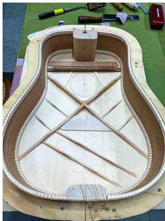
Interior detail before the back is glued on, showing the scalloped top braces, kerfing around the side edges and the end blocks.