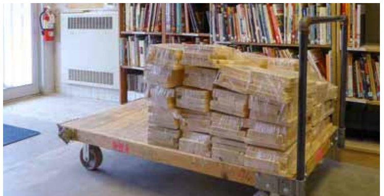
Tool tote kits ready for delivery