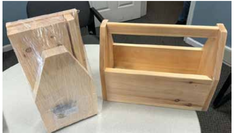
Tool tote kits

The NWA Crafters SIG has worked with Curtis Lumber to produce 250 tool tote kits and our friends at WWAARC have assisted with packaging the kits. Curtis Lumber supplied the lumber and hardware for the kits and LeChase Construction Services of Schenectady is making a generous contribution to support NWA for projects such as this.