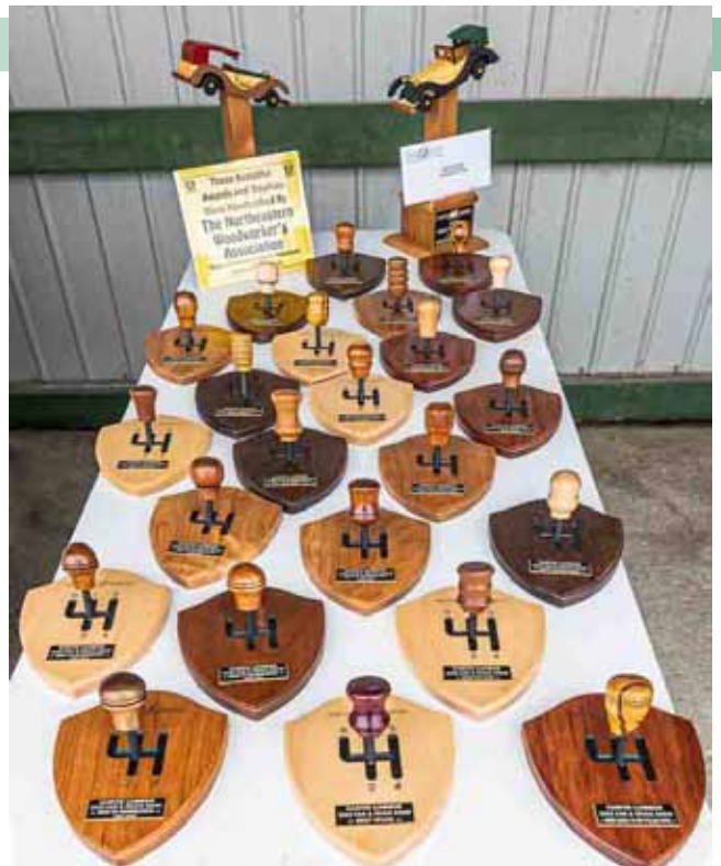
Car Show trophies

This year's trophies were AMAZING! We heard so many comments and I wish you could have