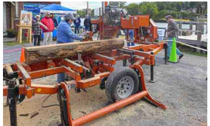
Alan Hayes demonstrated log sawing