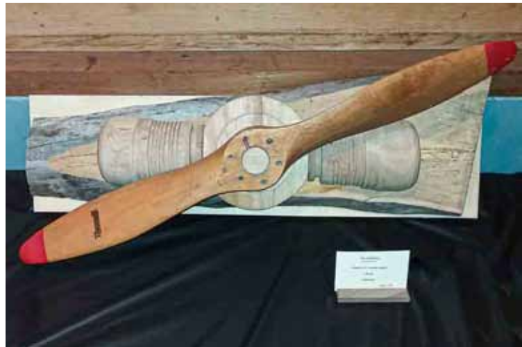
Pat Stefano's WWII drone motor