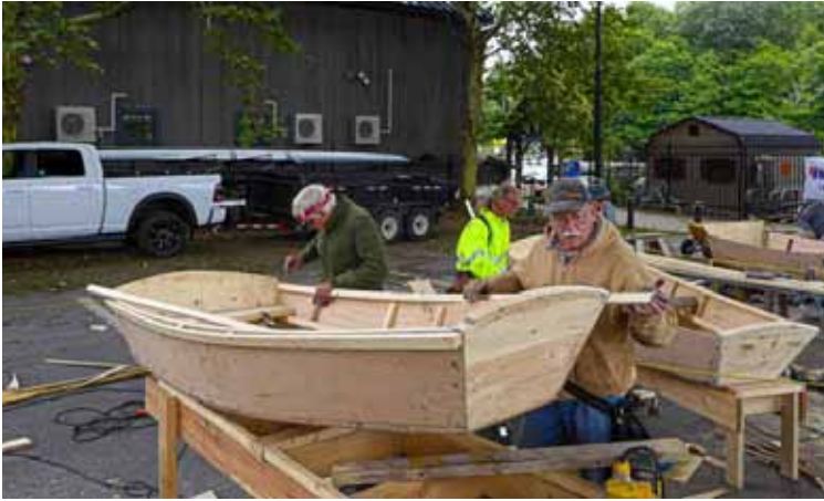
Eight teams competed in the Maritime Museum's Boat Building Contest

Thanks to all NWA & MHW members that worked together with the Hudson River Maritime Museum to put on a successful show.