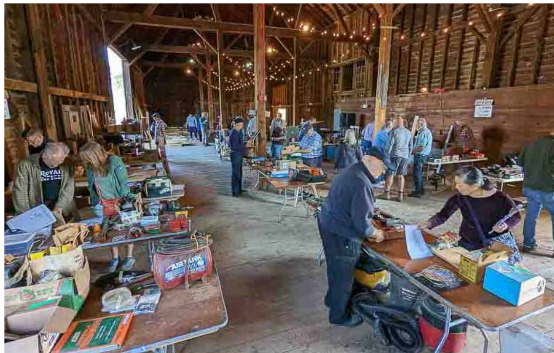
Cash & Carry section of the auction floor