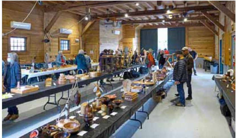
Over 150 fine woodworking items were on display

Many members from the Albany area provided assistance during the day, along with their display items and donations to the sales table.