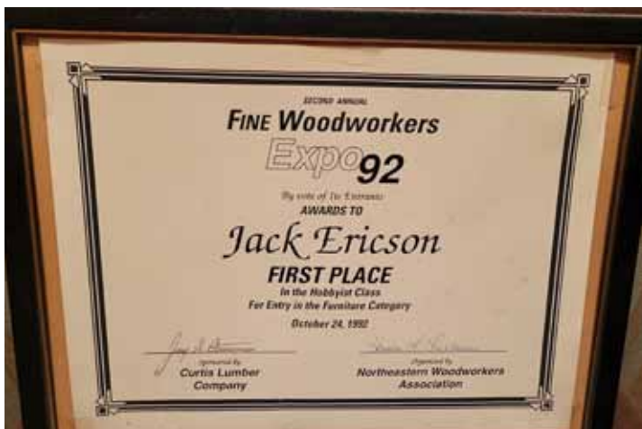
Award for NWA -Curtis Lumber Fine Woodworker(Furniture)