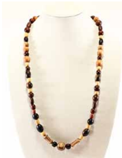
Jewelry by Don Orr

The Adirondack Woodturners successfully produced another excellent Totally Turning symposium in conjunction with NWA Showcase in Saratoga Springs over the last weekend of March 2022. Finally, back in action after a 2-year absence