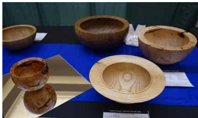
Angus ash bowl

spectacular as always with incredible work by some of the best turning artists found anywhere. I am sure the judges had a very difficult time figuring out who should get the ribbons in the various categories.