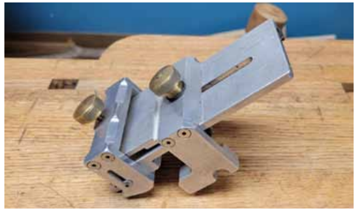
Custom honing guide not in production