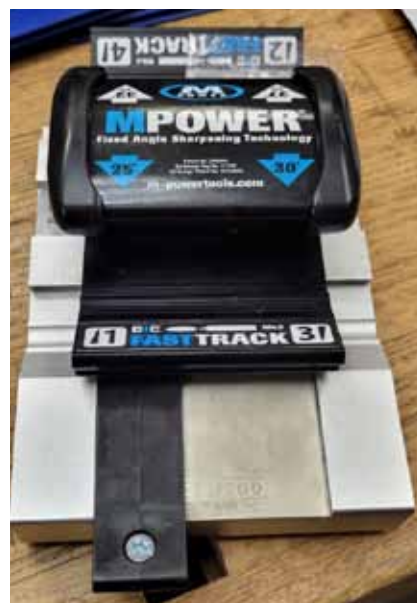
Fastrack M Power

NWA member, Gustave Mueller, showed his Fastrack M Power honing guide, with 25- and 30-degree fixed angles. The kit is $90 with 100, 220, 450, 600, 1200 grit stones which are easy to change. It will hone 1/8 inch to 2 ½ inch blades.