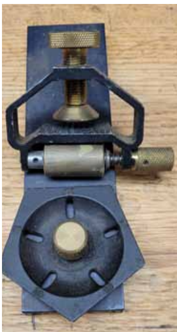
Veritas Mark II

• Veritas Mark II has a basic honing guide for $80 which is good for plane irons and chisels ½ inch and wider. A chisel will still pivot side to side, but there is an optional narrow chisel holder that prevents pivoting, but hand tightening may be insufficient. Its camber roller can make secondary bevels on chisels. The whole kit is $140. A skew registration jig is an additional purchase.