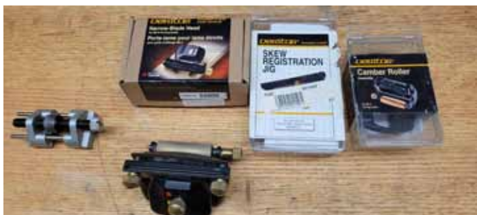
Dave's collection of honing guides

Eclipse guide was popular in the 1960's and can be purchased from Amazon for $15. It is used with a projection table like Juliana Shei's combination toolbox and table. Although affordable, the guide does not firmly hold the chisel's beveled sides, and it can rock side-to-side as one pushes the cutting edge on the stone. It cannot hold Japanese chisels or chisel