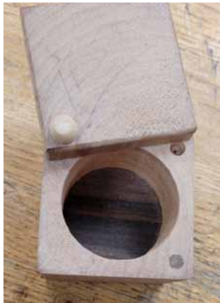
The interior shows hinged lid with earth magnet