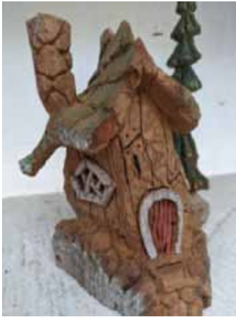
3-D Bark House