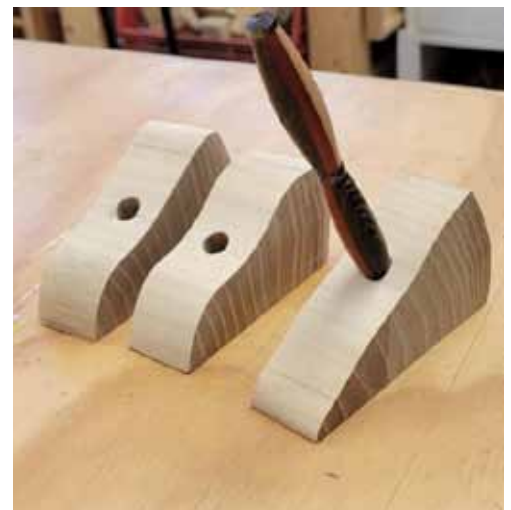
This year's pens will come with pen holders