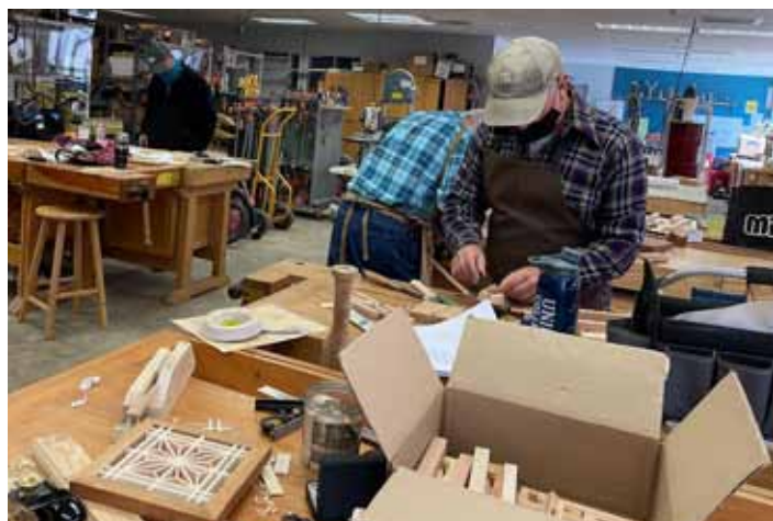
A completed framed panel as a model