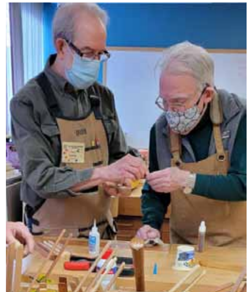
Tongs' assembly with earth magnets