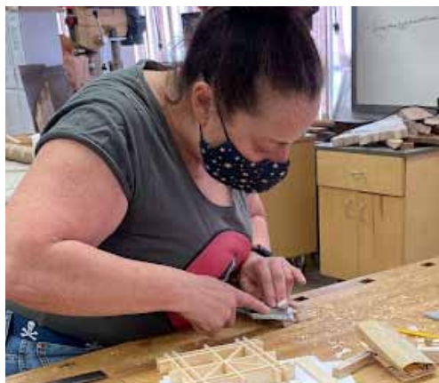
Sharp chisels are essential

"The class was very thorough. Being a small class was beneficial, whereas attention was given to any questions we may have had, I even got a lesson on sharpening my chisel! The class taught us ripping the wood into strips and then notching out the pieces to fit together snugly. From there, the cuts for the inside pieces were explained, as well as how the pieces fit together. It was a fantastic experience altogether and well worth the price."