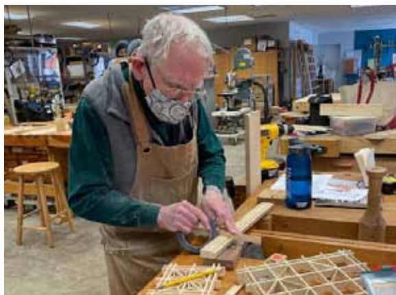
The panel frame is notched with a fine-tooth saw