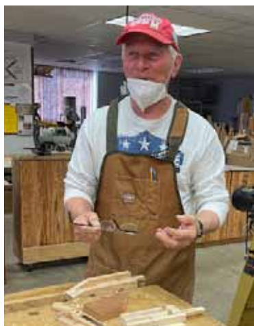
Students use custom made jigs to trim precise angles