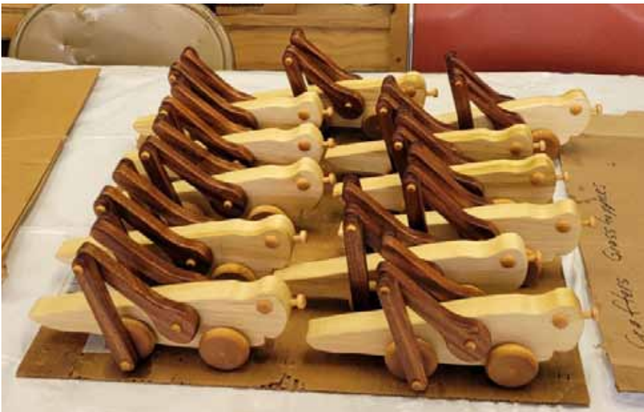
A multitude of toy grasshoppers