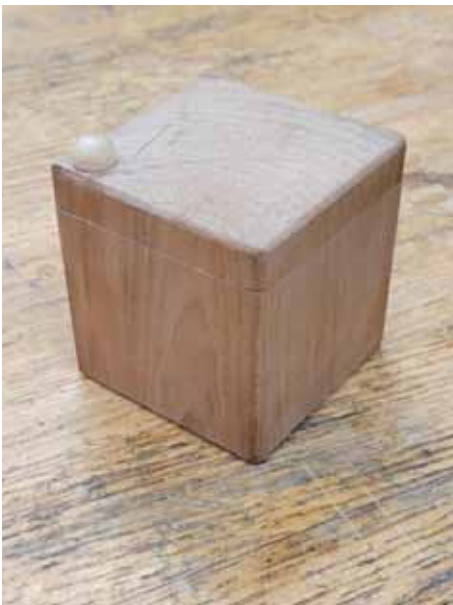
Dick Flanders made 28 ring boxes