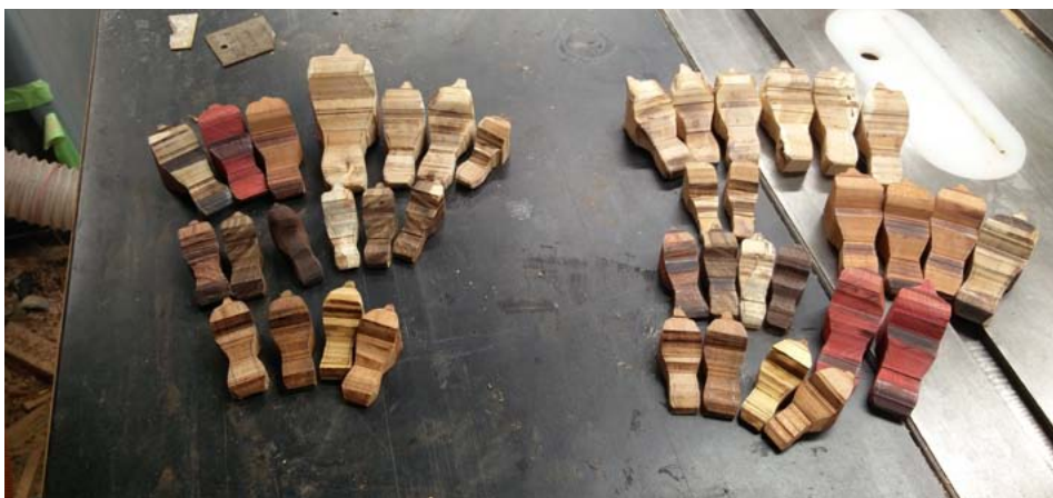
Birds blanks after band sawing