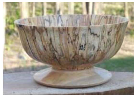
Paul's spalted bowl