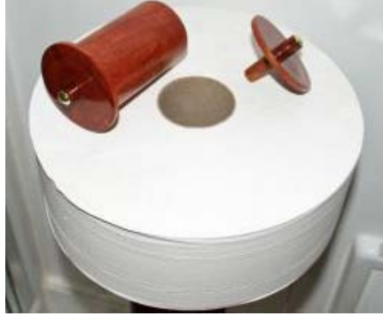
John's toilet paper roll