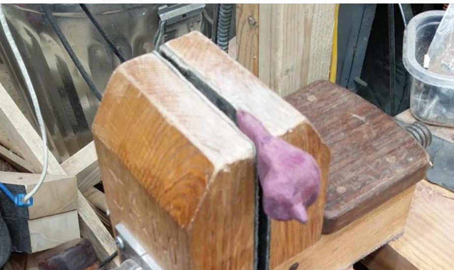
Purpleheart Bird in Hi-Vise