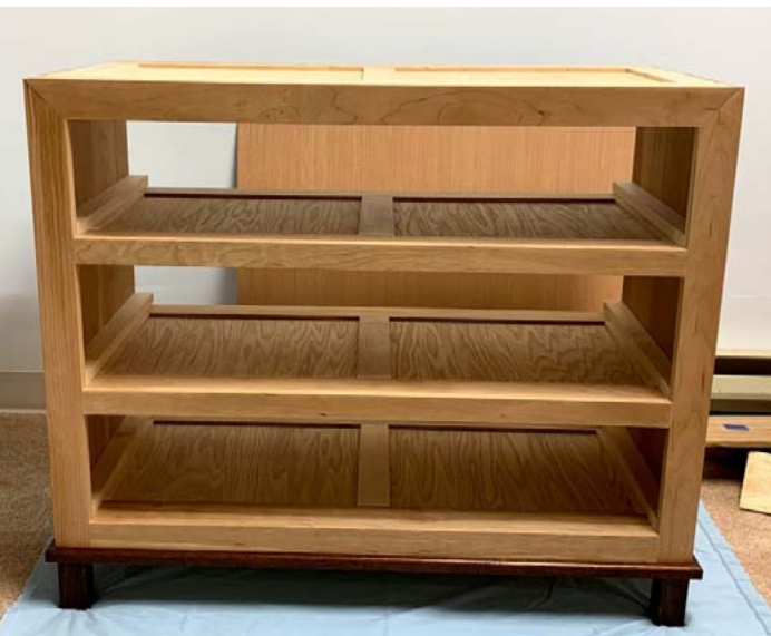
The carcass of the lower chest