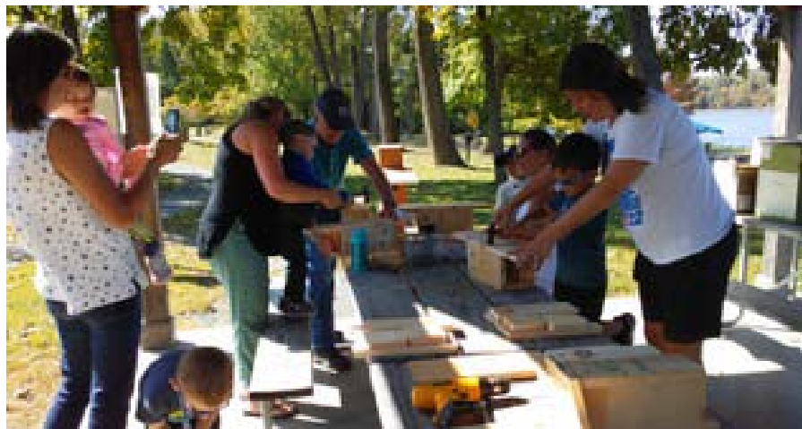
Schodack Island State Park Raptor Fest 2019