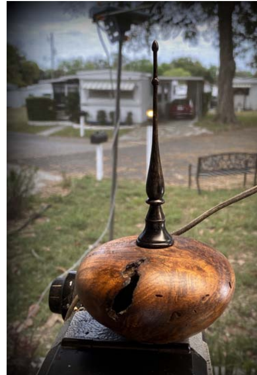
Doug's hollow form