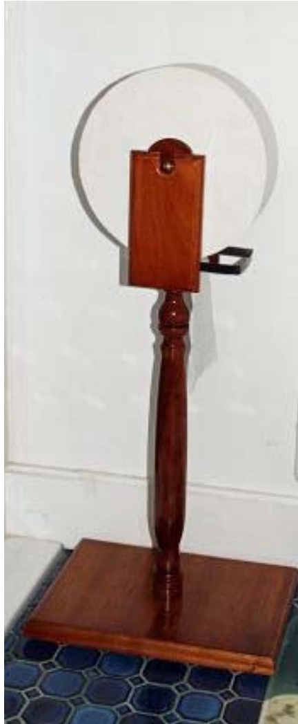
John's toilet paper holder