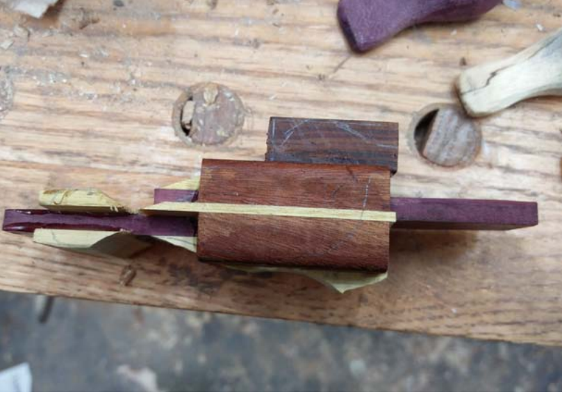
Latin American Bird (Purpleheart/Yellowheart/Goncalo Alves/Cocobolo) blank