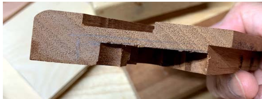
Three dimensions of joinery