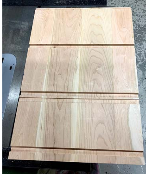
Clean cuts for partitions