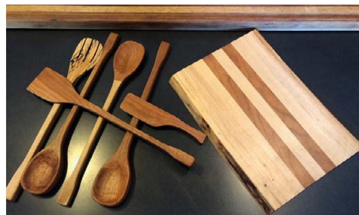
Kitchen utensils with cutting board