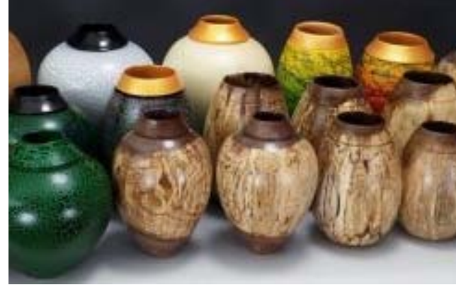
Carl's COVID collection