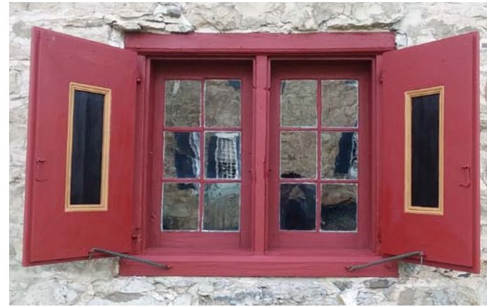
Jim’s hand- built window and shutters