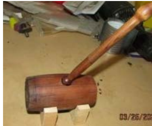
Pat’s redwood pen set