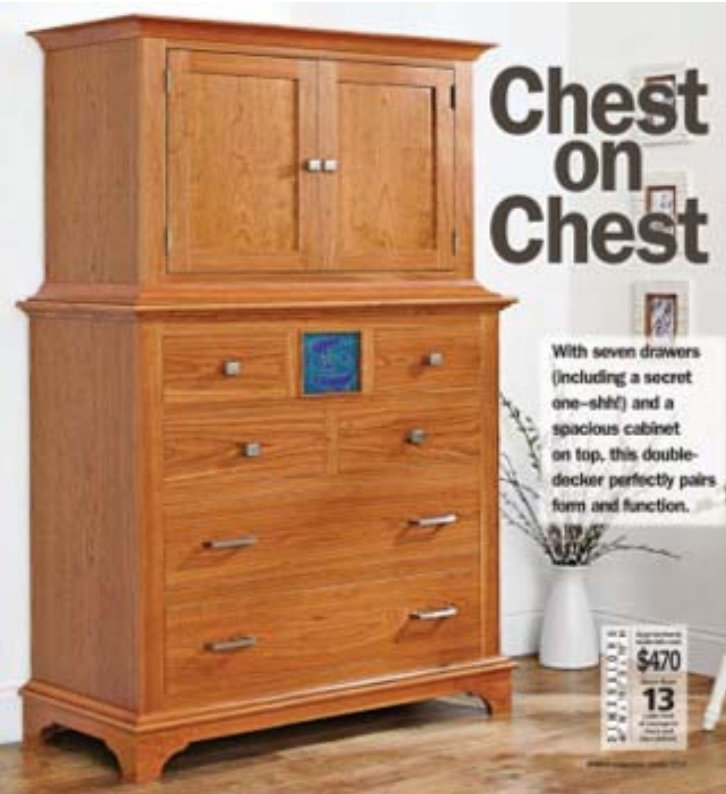
Wood magazine's design