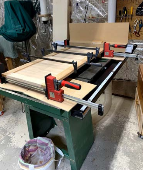
The glue ups required long clamps