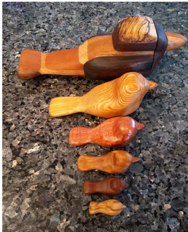
Different sized birds (Front to Back) XS Olive-wood, S lpe, M Lilac, L Bubinga, XL Douglas Fir, XXL Walnut/Maple/Cherry/Oak