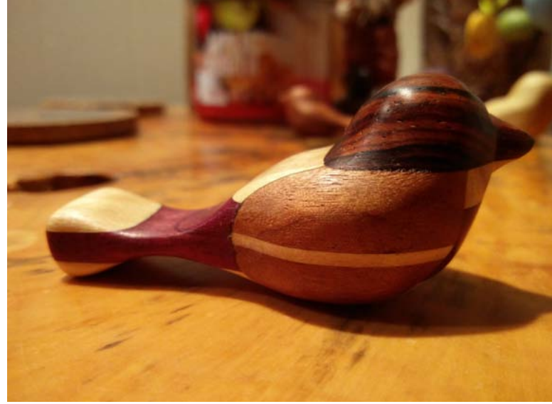
Latin American Bird (Purpleheart/Yellowheart/Goncalo Alves/ Cocobolo) finished