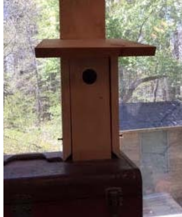
Voila! Step 6

The ASCR is currently applying for a grant from The National Audubon Society to build 100 Eastern Bluebird boxes in wood assembly workshops at middle schools by January 2021. These boxes will then be established in local preserves and farmlands to help Eastern Bluebird populations cope with loss of natural habitat due to dead tree removal and competition with other species. Once these boxes have been established, they will be monitored during the breeding season. Data will be submitted to the citizen science program NestWatch. If successful, ASCR will extend this project beyond these first 100 boxes. We're looking for woodworkers who might be interested in helping by cutting and drilling parts to prepare the wood before the assembly workshops. In addition, if some of you are willing to be an instructor during the assembly workshops at middle schools, any help is welcome.