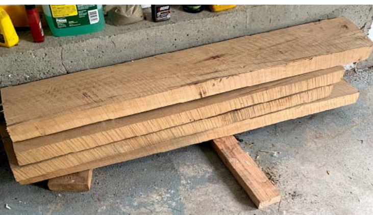
Raw wood of cherry and mahogany