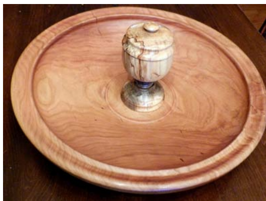
Wally's posset cup and fruit bowl