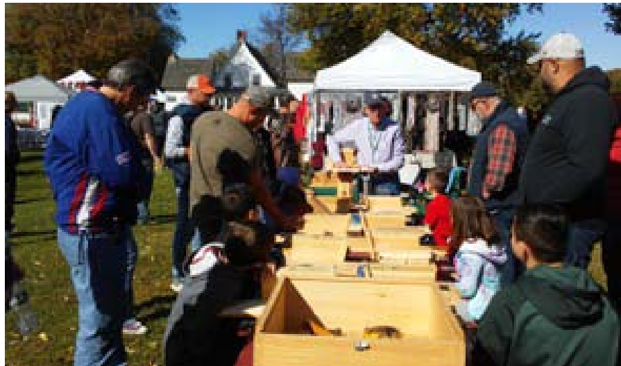
Mabee Farm (Rotterdam) Fall Festival in October 2019