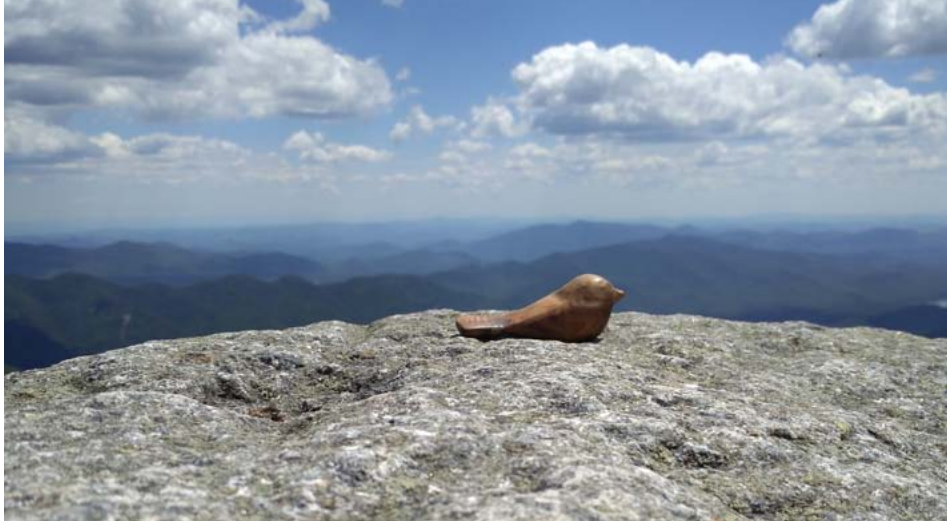
(Black Locust) on top of Mount Marcy

I started making Comfort Birds a few years ago as a way to woodwork "in the wild" away from my shop. All you need is a piece of wood, a knife and some sandpaper (and a Hi Vise is optional). I made and gave away a few dozen to friends and relatives in need of comfort. Then one day I decided to make one for myself, from a Black Locust tree in my yard. Shortly after I thought it would be cool to make one from every species, I could get my hands on. I now have over 100 birds in 47 species and 37 different genera, also some metal and plastic ones. I carry a bird with me almost every day. They are like having a worry stone or a less annoying fidget spinner. I planned on having a display in Showcase, but now they will wait until 2021. If anyone is interested in helping my flock grow, I can make one bird out of a 1.5"x1.5"x3.5" blank or two birds (one for each of us) out of 1.5"x1.5"x5" blank. If you are interested, I can send you a list of the species I currently have. Just shoot me an email: grateful4thedead@gmail.com