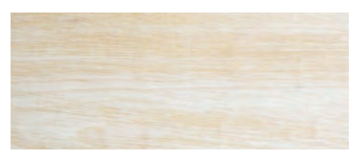
Standard 1/2" x 3" x 6" specimen

The edible seeds of the pinyon, known as pinyon nuts, Indian nuts, or pine nuts were a staple food of the southwestern Indians for thousands of years. Today the pine nuts are the most valuable product