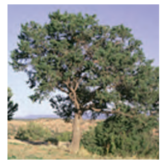
Typical pinyon tree

across the equator into Sumatra. Pines are found throughout Europe, Asia, North Africa, and North and South America. There are about 71 species found in North America, 36 native and one naturalized (Scots pine, Pinus sylvestrus ) in the U.S. Nine of these are also native in Canada.