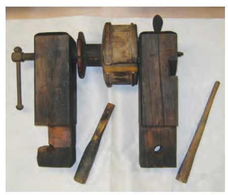
Hurley lathe headstock and pulley assembly

we know that lawn bowling pins were occasionally produced on this lathe. In the summer, the lathe was kept in a workshop building, but with colder weather coming, it was moved into the farmhouse kitchen on the ground floor. Such a move also involved relocating