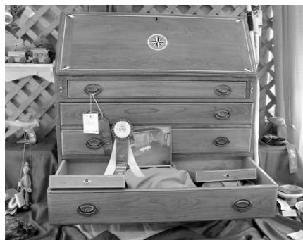
Duane's chest with inlay