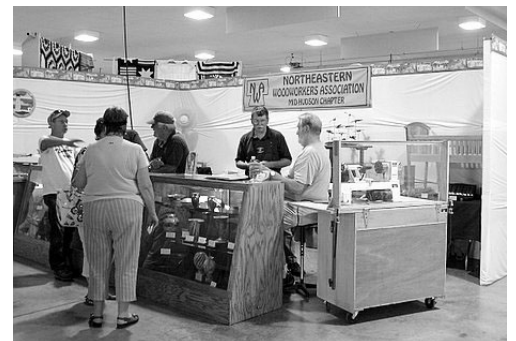
Mid-Hudson booth at the Dutchess County Fair