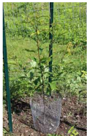
Mother trees should be planted in well drained, acidic soil and protected from rodents

The SUNY College of Environmental Science and Forestry at Syracuse has pursued a strategy of transgenic botany, splicing a wheat gene onto the chestnut, allowing the tree to wall off the parasite. While it does not