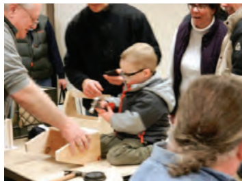
Another Toy Factory apprentice!

Toy Factory: Kids, parents and grandparents all enjoyed the activities going on at the Toy Factory that was part of another very successful 2014 Showcase. You just cannot keep even a young child from having fun with a hammer and nails. The child pictured below did need a little assistance from Dad, but he took home a tote box that he put together.