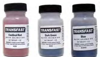
Cardinal Red Dark Green Blue