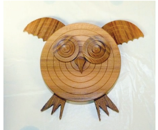
Completed Owl Plaque