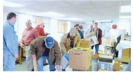
They say half the fun is getting there!

As a result of these seamless efforts, the two days were enjoyable. All told, forty-seven volunteers from Mid-Hudson assisted at the Toy Factory or in loading/unloading materials. Over 250 birdhouses, cars, and planes were co-produced with children visiting the Toy Factory and an additional 193 whistles, cars, and planes were given away to children at the show.