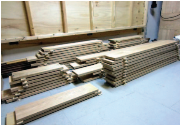
White oak sign stock that was milled by NWA Mid-Hudson members