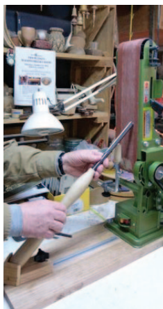
Belt sander with jig