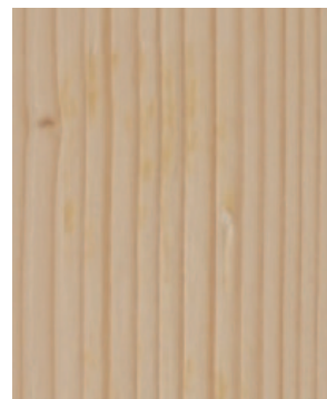
Specimen of grand fir wood

Grand fir is highly susceptible to drought and to several damaging insects and diseases, especially the balsam wooly adelgid and root rot. The greatest threat is probably wildfire. Good control and suppression have done much to reduce those losses. Supplies are good and reforestation projects usually exceed consumption. 🌲