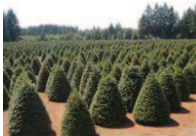
Grand fir Christmas tree plantation of 5 year old trees

Sapwood is whitish to light buff, heartwood is a little darker. Growth rings are quite distinct, varying with growing conditions. Dry wood has no characteristic taste or odor. Rays are indistinct to the naked eye. Typical of the true firs, this species has no resin canals or ray tracheids.