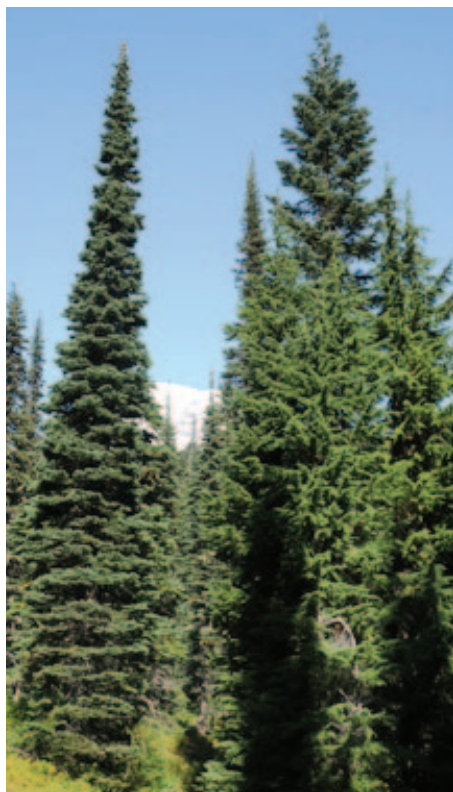
Grand fir trees

The true firs are monoecious—male and female flowers develop on the same tree on branchlets from the previous year's growth. Male flowers are pollen bearing only; female flowers produce cones which mature in one season. Cones are 2 to 4 in. (5 to 10 cm) long, barrel shaped, and borne upright on the twig. Most of the large, winged seeds drop before the end of October. The greenish hue of these cones distinguishes them from the olive-green to purple cones of the white fir, A. concolor . The bark is thin, gray with resin blisters when young, becoming brown with shallow ridges and then deeply furrowed with age.