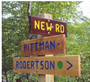
Signage is key in the 22 miles of trail system at Stewart Forest

Stewards of Stewart (SOS) is an all-volunteer, 501(c) (3) non-profit organization authorized by the NYS DEC to do trail maintenance, clear blow-downs, etc. in Stewart State