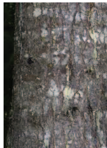
Stem of grand fir