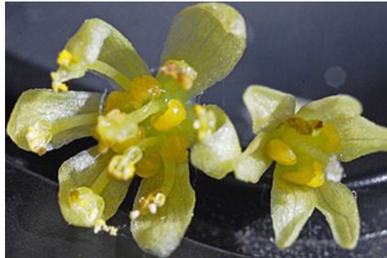
Male and female leaves

Native Americans valued the bark for dugout canoes. It is a poor firewood as the oil causes numerous little noisy, sparky explosions as it burns.