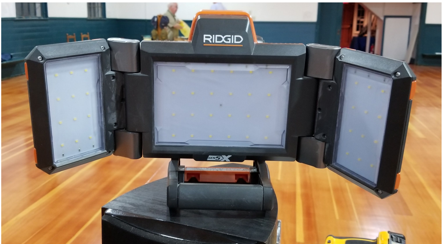
Rigid Bright Work Light