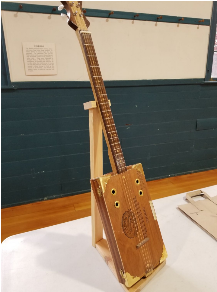
Hedman's cigar box guitar

Jon Hedman's four string cigar box guitar with white oak neck, walnut fret board, tuned to G chord.