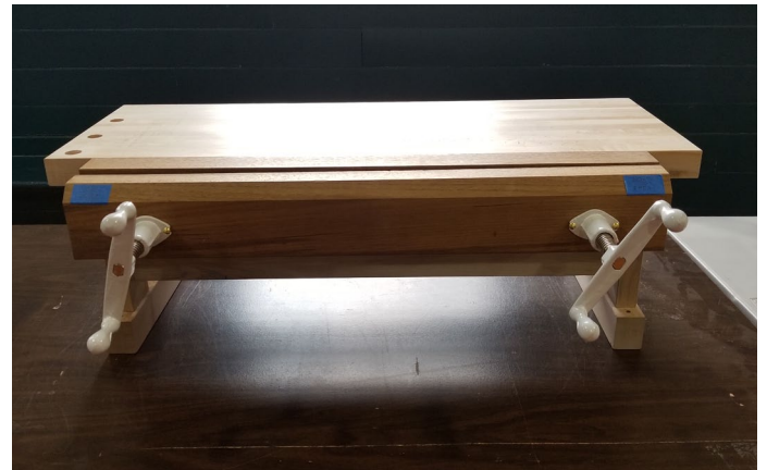
Blanchard's stool and raised workbench