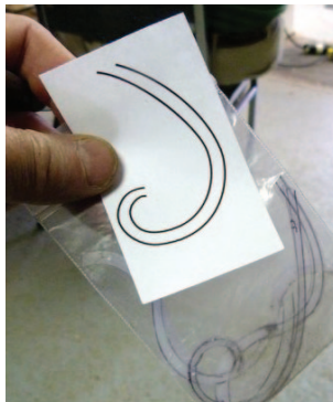
Plastic templates are used to transfer the slot design to the bowl