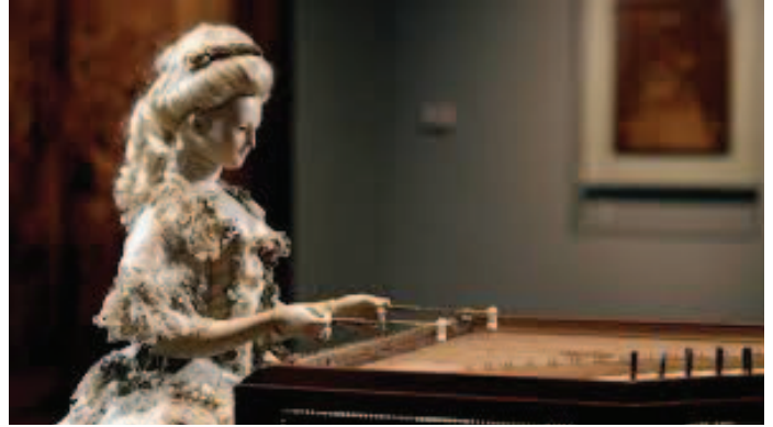
The automaton dulcimer player