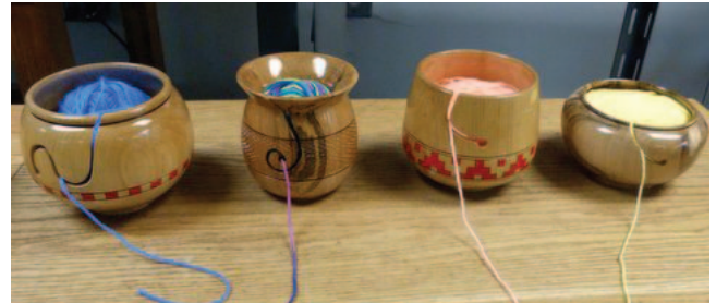
Selection of finished knitting bowls

a Rolly Munro tool) to refine the sides of the bowl. Use a light touch as you slice the grain and work towards your final wall thickness. I work for a wall thickness of ¼" to 5/16" thick. You want the bowl to have some heft so that it will be stable when in use, but you do not want the wall to be so thick that it looks klutzy.