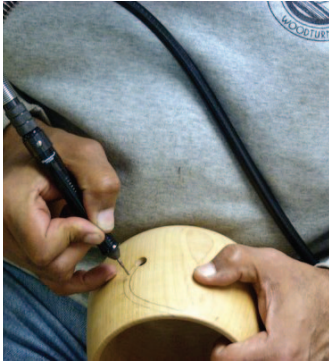
Carving the slot for the yarn