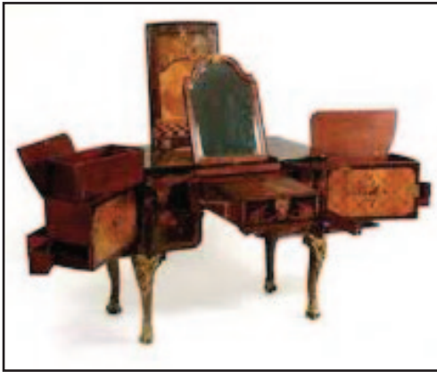
1789 dressing table features hidden drawers and mechanical triggers

Although David was appointed as “ébéniste-mechanicien” (cabinet maker-mechanic) to Queen Marie Antoinette, the Roentgens never moved their workshop from Neuwied, Germany. After the French revolution, the Roentgen workshop did not fare well – and many of their pieces were lost to history. The Met produced the exhibit to share documents and furniture celebrating the extant works.