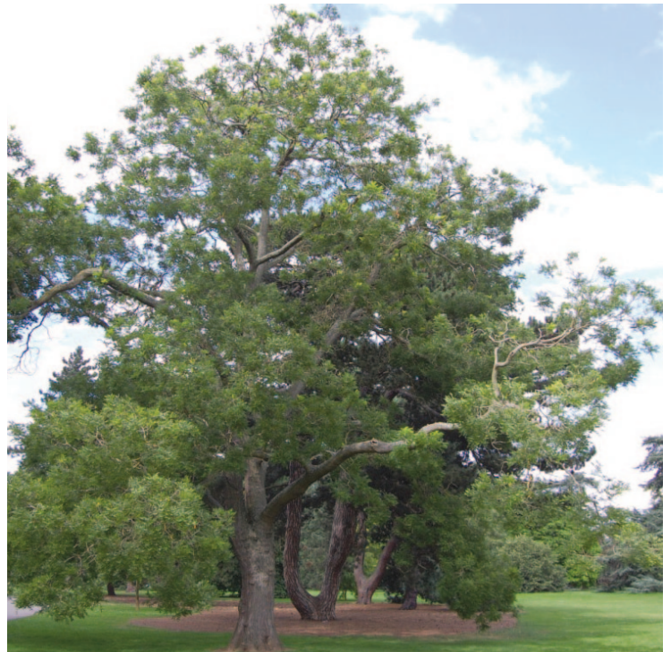
A "Quartet" of mature trees