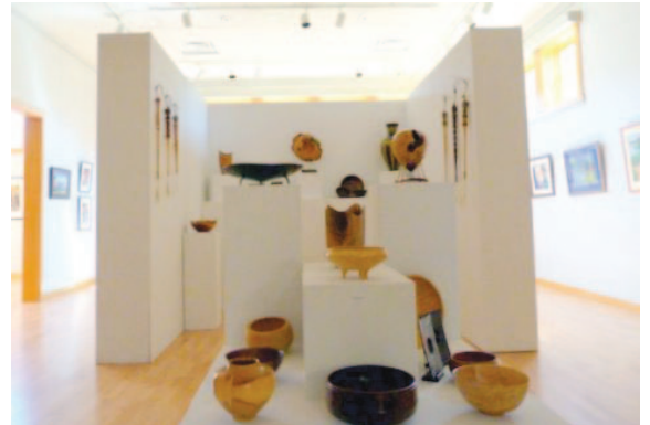
Woodturnings were distributed in three of the four exhibit rooms