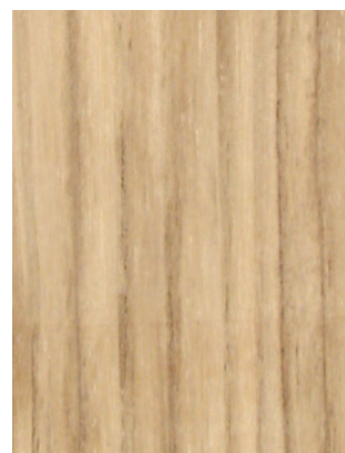
Wood specimen of Sophora japonica

Because of its showing flowers, the Chinese scholar tree is a popular ornamental in Europe, Hawaii, South Africa, and wide portions of the southern and western U.S. where it often serves as a shade tree. In the Orient, tree buds were a historically important source of a brilliant yellow dye, used and traded around the World. Here too, wood from the same trees, because of its durability, was used to construct framing and columns for homes and places of worship. In Japan this wood was chosen to make the strong, springy, curved handle for the traditional woodworkers' adze, the Chouna .