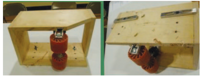
Two views of Bill's resawing jig

HSS blades are good up to 1200 degrees. Bill dedicates a bandsaw exclusively for resawing. Early experience showed that cutting bowl blanks on his bandsaw tended to ruin it for the straight cutting.