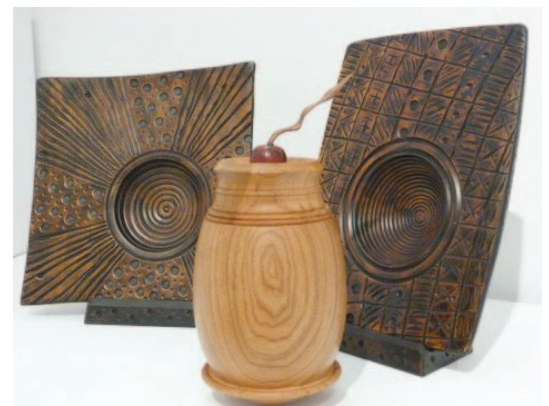
Carl Ford's square bowls and Wally Cook's pendulum box