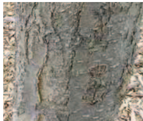
Bark of a mature tree

First blooms on trees begin at 10 to 15 years. Flowers are 0.5 in. (12 mm) long, pea shaped, with five unequal, creamy-white petals in upright or spreading, loose, showy clusters. Clusters are typically 6 to 12 in. (15 to 30 cm) long at twig-ends in late summer. Flowers have a slight pleasant scent, lasting about a month.