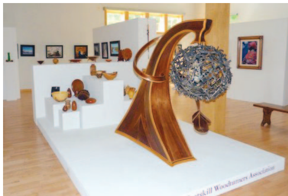
Brad Conklin's Tipping of the Trades was the centerpiece of the main exhibit room