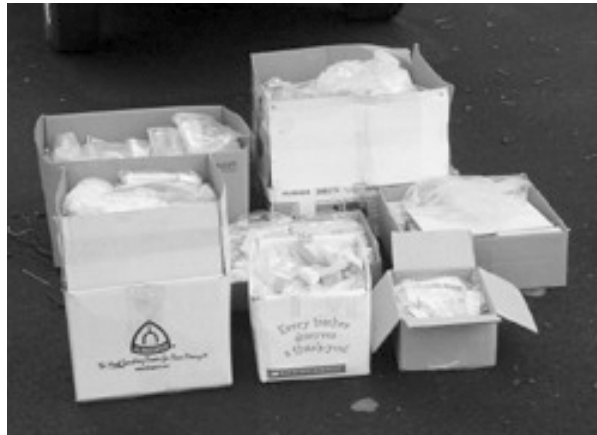
Kits ready to go.