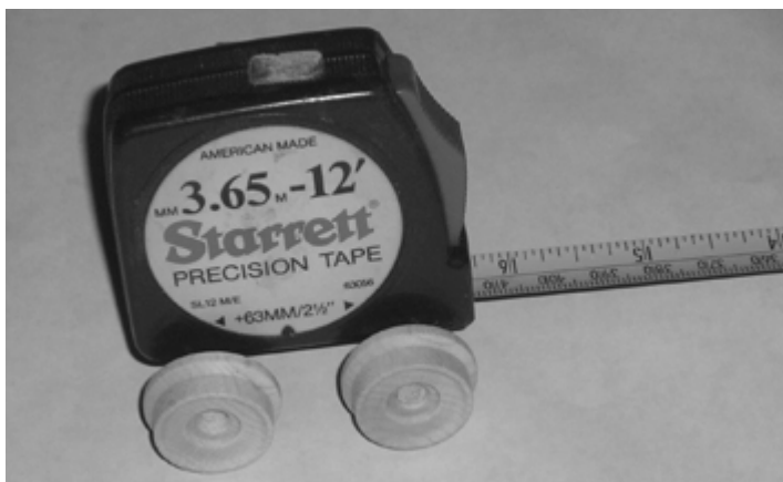
After a brief consultation the judges disqualified this entry.