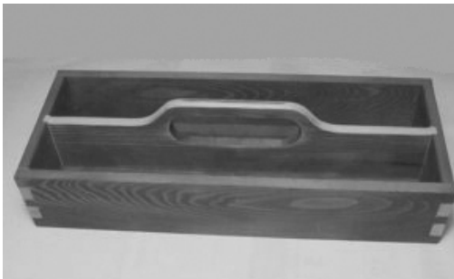
Dick Flander's 2 x 4.