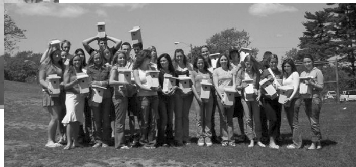
Kingston High School students show off their products.