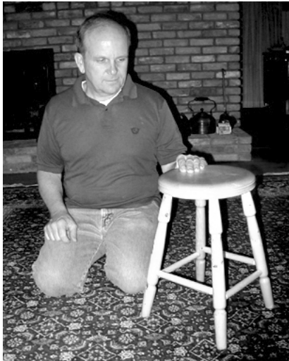
2 x 4 stool by Tom Osborne.