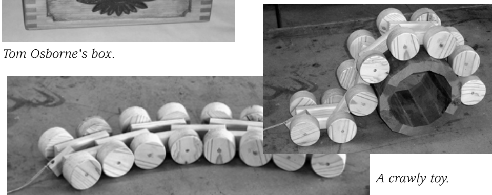
A crawly toy.

WOODWORKERS NEWS is published by the Northeastern Woodworkers Association for its members. The Association's aim is to provide a common meeting ground for lovers of woodworking who want to know more about wood and the techniques for forming it. The newsletter is published monthly. It is assembled in QuarkXPress 5.0 on a Macintosh G4, duplicated by Shipmates, and mailed to more than 850 addresses.