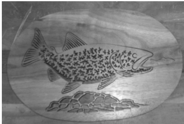
Fish and 9/11 scene by Glen Cullen.