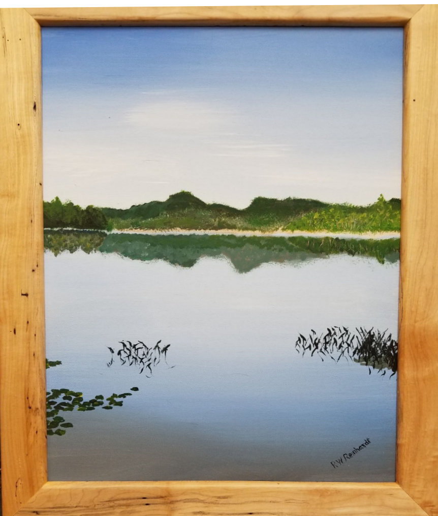
Putnam Pond