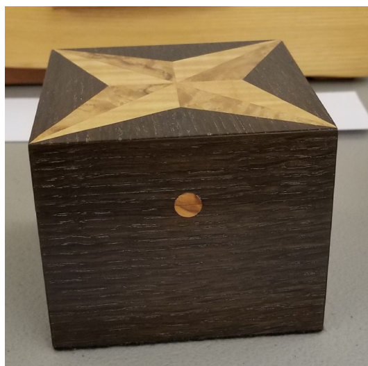
Small walnut box with inlay by David Grunenwald