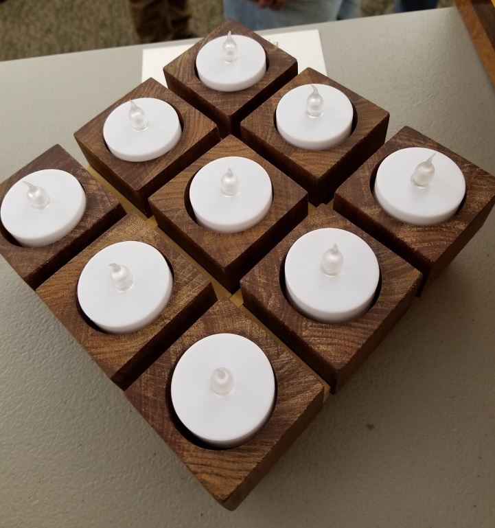
Tea light base of cherry and oak by Wayne Distin