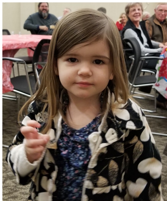
Future wood worker receives gift from NWA