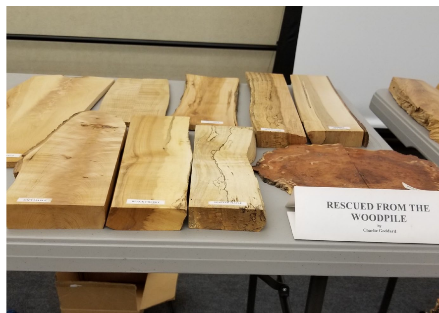
Charlie Goddard's "rescued wood"