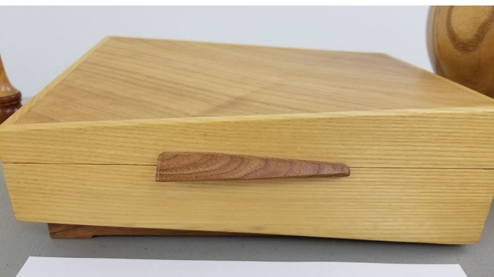
Tom Osborne's hyperbolic box