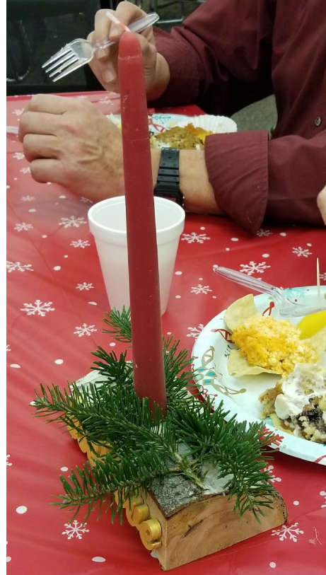
One of eight center pieces by Jeanie Aldous