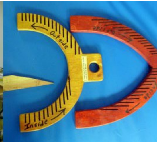
Carl Ford demonstrates teaching aides to show cutting direction for maximum grain support