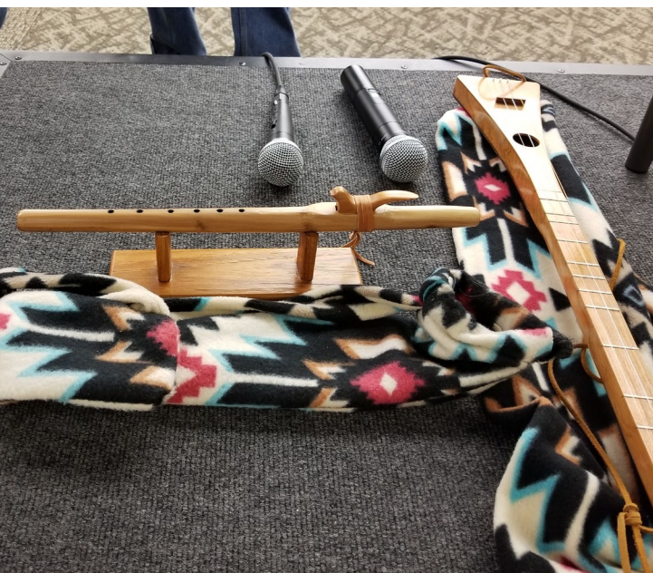
Applewood flute and music stick by Jon Hedman