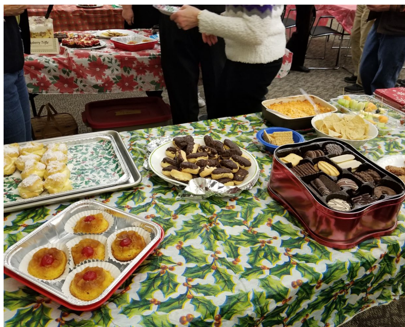
Tables of goodies