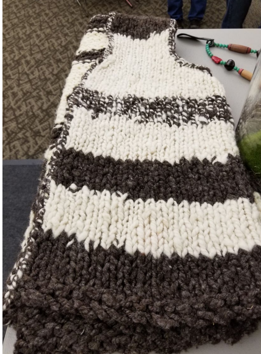
Wool vest by Pam Bucci