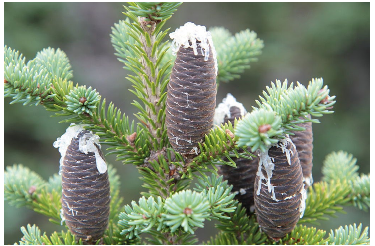
Balsam Fir leaves and cones

The wood of the Balsam Fir dries quickly with moderate shrink and little check or warp.