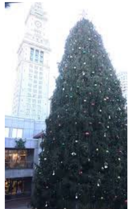
The holiday tree

The supply of Balsam Fir is good although it is probably not practical to try to find the wood in a lumber yard. Unless cut as big trees, it would go to the pulp mill. If cut from saw logs, it is probably included in that catch-all SPF (spruce, pine, fir) and sold for construction use.