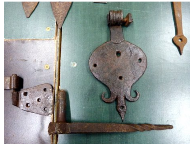
Old Dutch colonial pintals and hinges