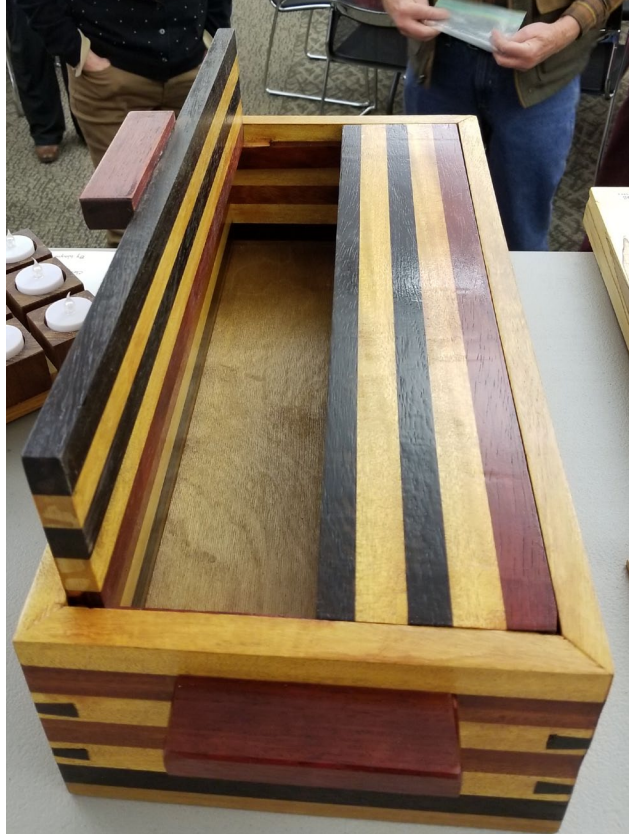
Box of multi hard wood composition by Lou Hill

UNLESS OTHERWISE NOTED, PHONE NUMBERS ARE IN AREA CODE 518