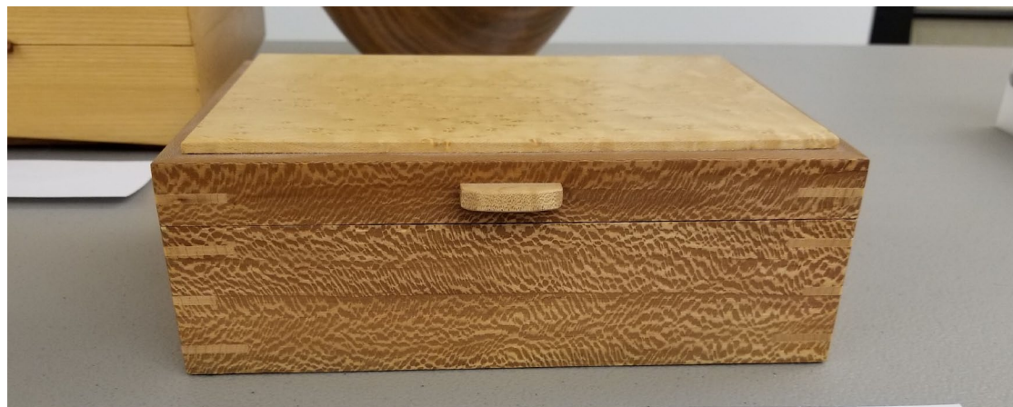
Charlie's box speaks for itself