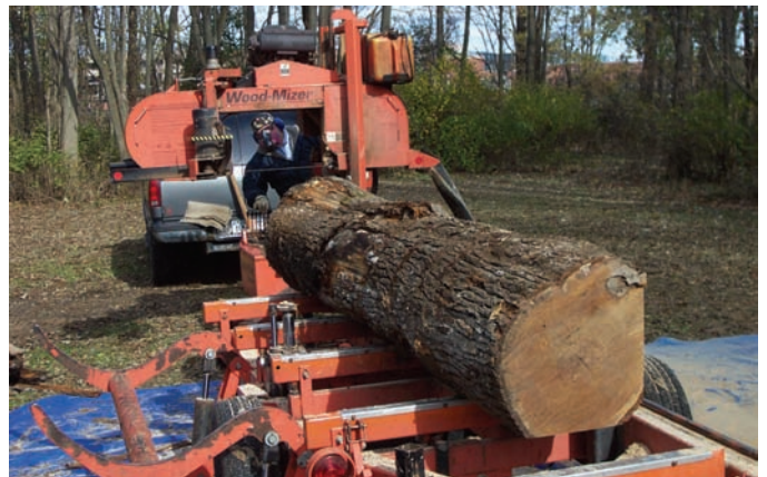
Cutting open a big red oak log from the Global Foundries site