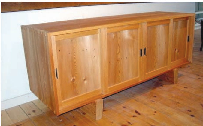
A cabinet made by Andy Hunter features proud dovetails

Joe Benkert and Steve Sherman described a visit to Rod Sage at Catskill Mountain Crystal in Samsonville, NY. Rod has a specialty business in producing glass candles, which use lamp oil. A movie-maker clip was shown to highlight the methods of work used by Rod, who can complete a candle in about five minutes. He uses a special lathe, which holds glass tubing. Both head and tail-stock are synchronized and turn at very low rotation. Shaping is done by stretching and compressing the glass. Rod keeps air pressure in the candle blank by blowing