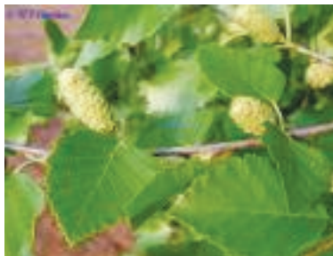
Leaves and female flowers