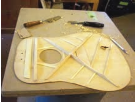
New interest group will meet the second Tuesday of each month

many types of wood were employed). By the beginning of the 19th century, red became a favored color – and by mid to late 19th century, the vogue was black. As chairs were repainted and aged, various layers of older paint became visible. This style has been incorporated in many reproduction chairs.