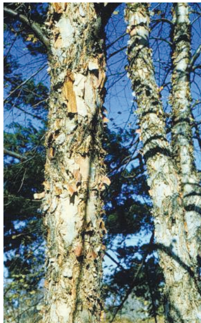
Coarse, flaky bark