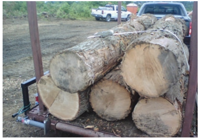
Five of the logs obtained from Luther Forest from Global Foundries