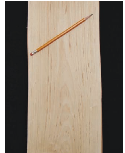
8" board with pith fleck streaks

River birch is monoecious, male and female flowers are on the same plant. Pollen-producing male catkins form on twig tips in autumn, maturing in April or May of the next year. Female seed-producing catkins are smaller and upright, releasing tiny two-winged fruits (nutlets) in spring or early summer, the earliest of the birches to do so. Good seed crops occur almost every year.