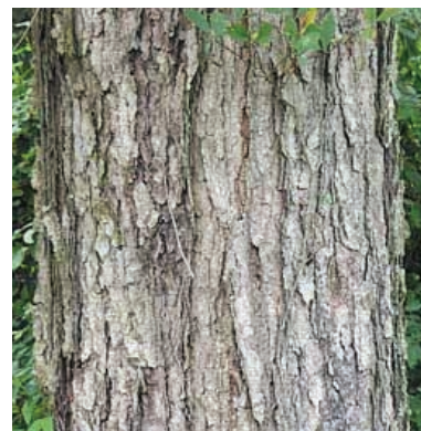
Bark of mature tree

River birch trees are quite resilient, enjoying a life relatively free of most of the usual diseases of trees. Only occasionally is it bothered by mistletoe infestation or a fungus caused leaf blight. It is considered un-threatened and supplies are good.