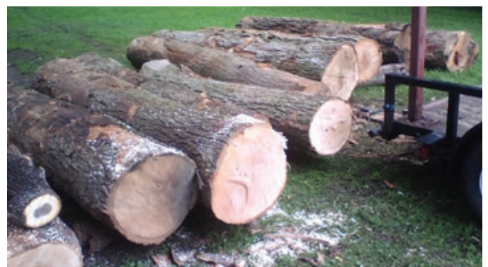
Logs collected one day from Luther Forest donated by Global Foundries