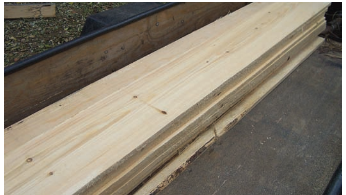
Some pine boards cut from the logs donated by Global Foundries