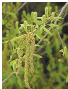
Male and female flowers

This tree is seldom cut for lumber because of its poor form, frequent reaction wood and plentiful knots. It is used locally for craft items, wooden-ware and inexpensive furniture. In the southern U.S., planters once used it for hoops on rice casks. Some is used for paper pulp, only when mixed with other hardwoods. Occasionally good saw logs will be used for veneer and plywood core board. Its hot weather tolerance makes it most important as a popular ornamental; many cultivars are available for landscaping. Occasionally it is planted as a street tree. Typical of the