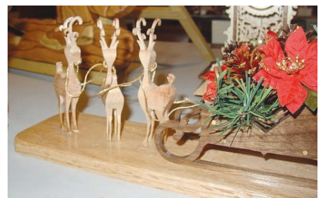
Jack Collumb's 3D scroll art