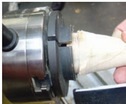
The tree is offset by chucking the piece at an angle, using the second groove as a registration mark