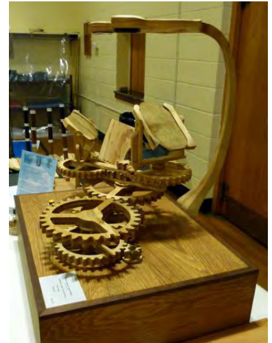
Brad Conklin and Chuck Walker teamed to display a 2000 year old piece of wood in a novel way