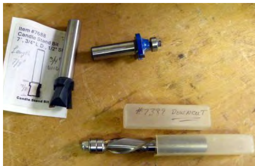
Bits used in construction of the table