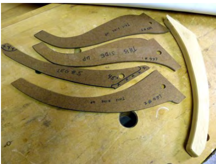
Templates for the legs