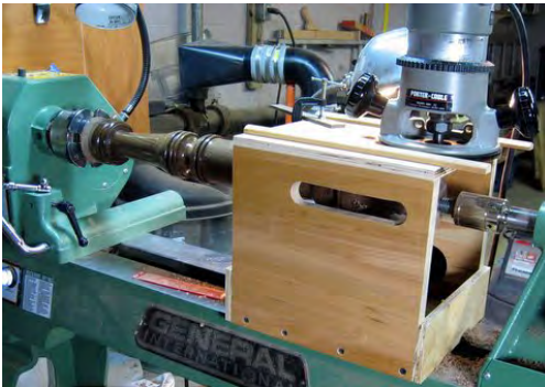
A jig is used to cut the sliding dovetail

Slots must be routed into the bottom to join the legs with a sliding dovetail joint, requiring a mortise 3" long by 3/8" deep. Ralph has made a jig to complete this task. He first makes three passes with a straight bit, then switches to a final pass with a candle stand dovetail bit to finish the receiving mortise for the legs.