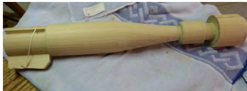
The central column for the candle table

Slots must be routed into the bottom to join the legs with a sliding dovetail joint, requiring a mortise 3" long by 3/8" deep. Ralph has made a jig to complete this task. He first makes three passes with a straight bit, then switches to a final pass with a candle stand dovetail bit to finish the receiving mortise for the legs.