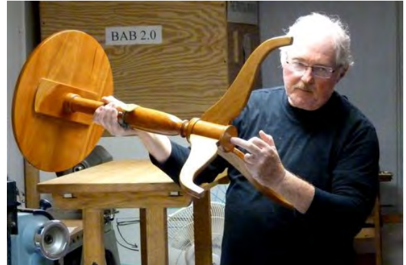
The table top is supported by a cleat. Another cleat can be added to the bottom of the column to hide the dovetail

is centrally positioned in the bottom of the table top for stability when attached to the column. A hole is centered in the bottom of the cleat and table top. A 1 ½” forstner bit penetrates the cleat, ¾”-1” into the actual table top, creating the mortise for the central column tenon.