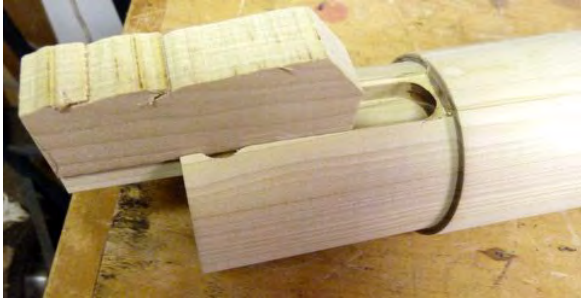
The shoulder on the column allows the leg to cover the sliding dovetail slot

The dovetail bit is employed to create the tenon. The sliding dovetail joint is tested for fit and ½” of the leading edge of the dovetail is chiseled off, so that the leg joint completely covers the mortise in the central column. In the final construction, a cleat may be added to the bottom of the column to hide the end grain of the joint.