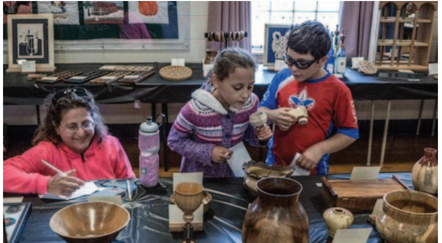
Kids enjoy the Hurley Show. A family votes for Popular Choice