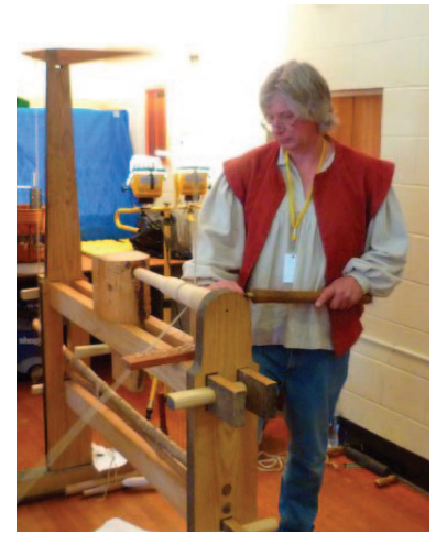
Onrust Project volunteer makes belaying pin on pole lathe