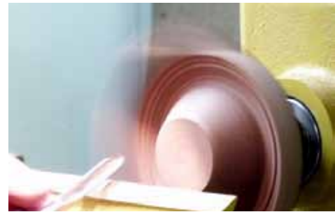
The bottom is turned, shaping the wings and bottom of the bowl