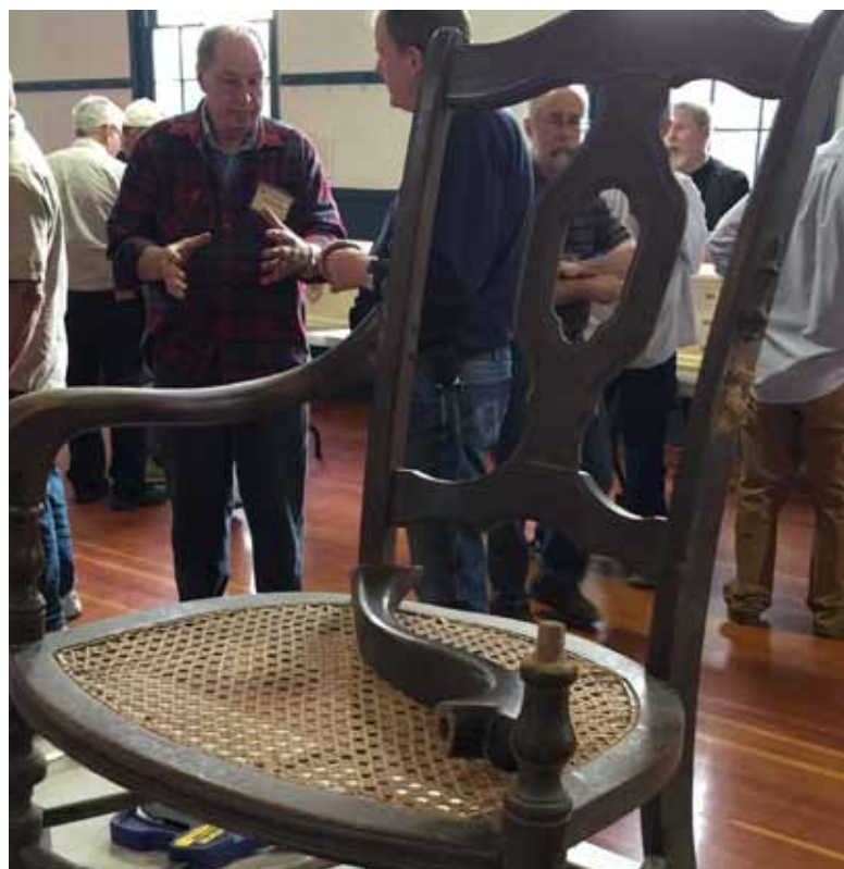
Broken chair arm